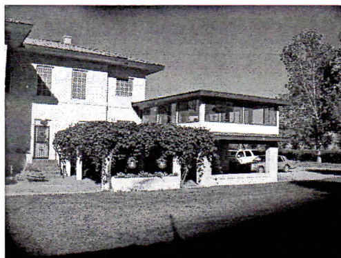
Churchill Winery Grapevine covered driveway