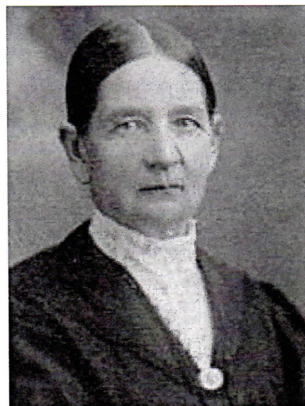
Approximately 65 years old