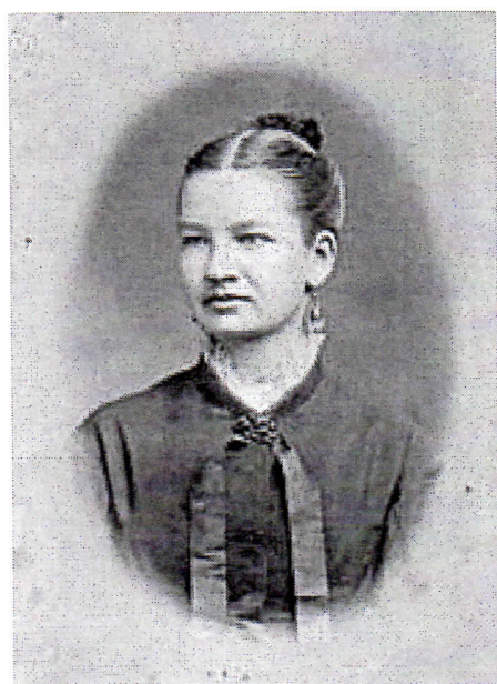
Approximately 39 years old

between eleven and thirteen I read in the third chapter of Genesis: 'Thy desire shall be to thy husband and he shall rule over thee.' That man should rule over woman was to my mind unjust. I went to my mother with my protest and she told me the husband's rule was right only when it was a righteous rule. That silenced my tongue for a time but not my mental protest."