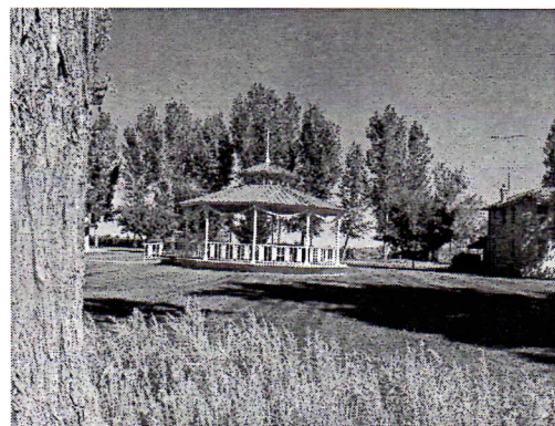
Sun room and gazebo